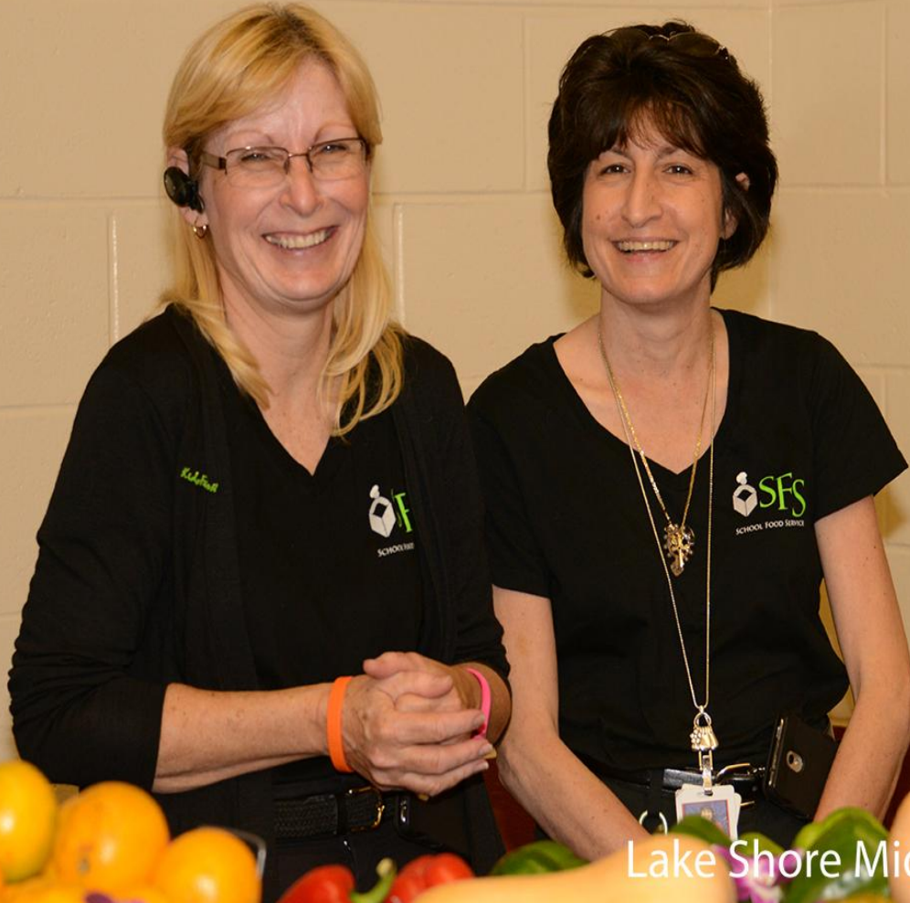
Lake Shore Middle - Health Fair March 12, 2014