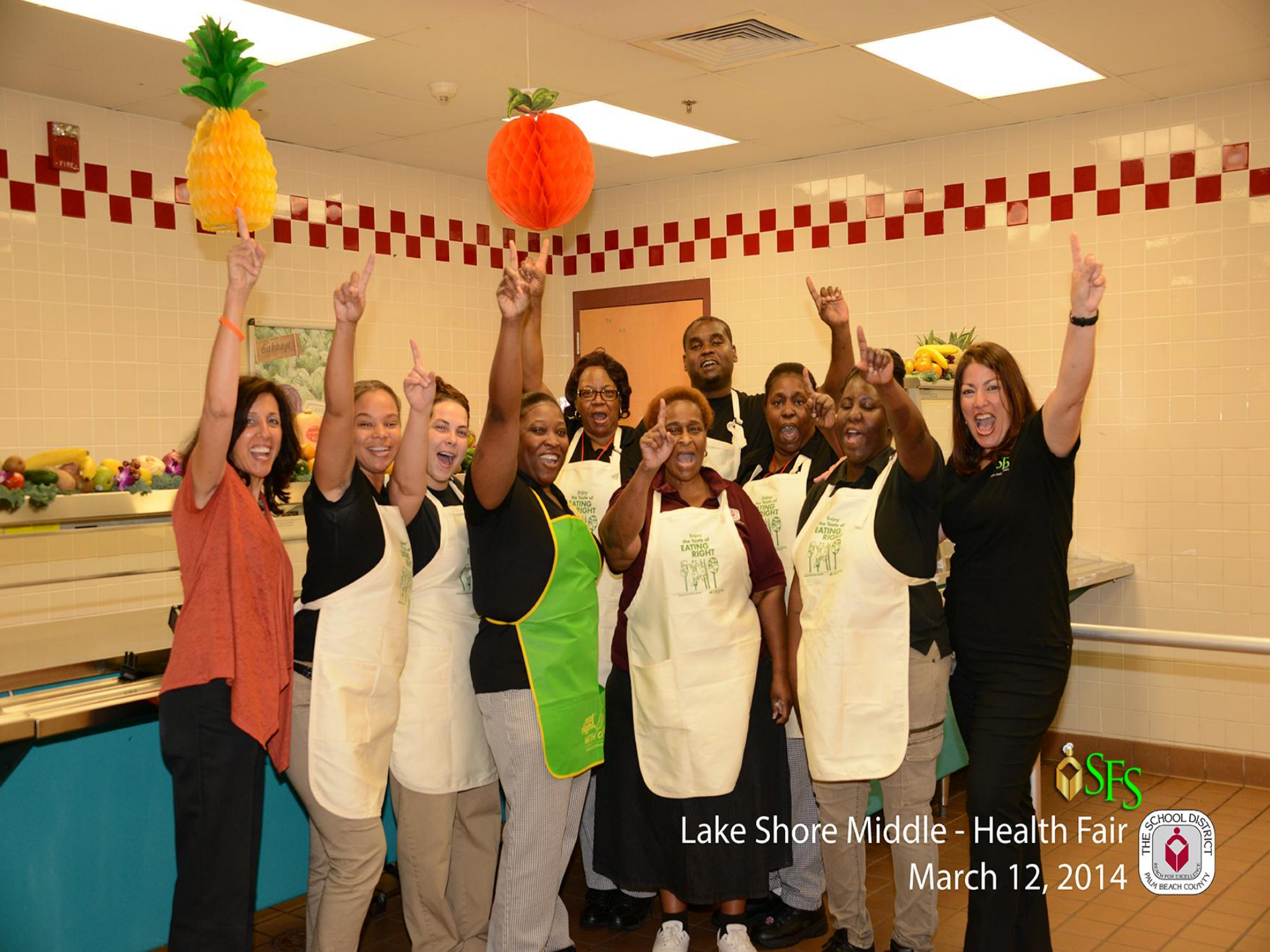
Lake Shore Middle - Health Fair March 12, 2014