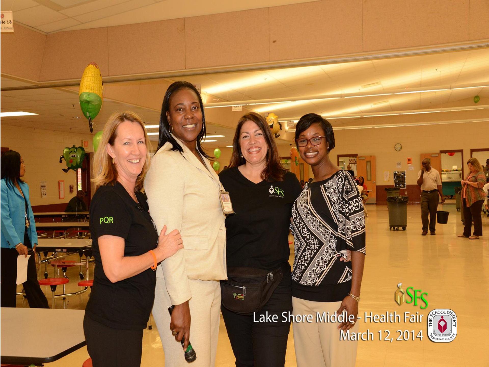
Lake Shore Middle - Health Fair March 12, 2014