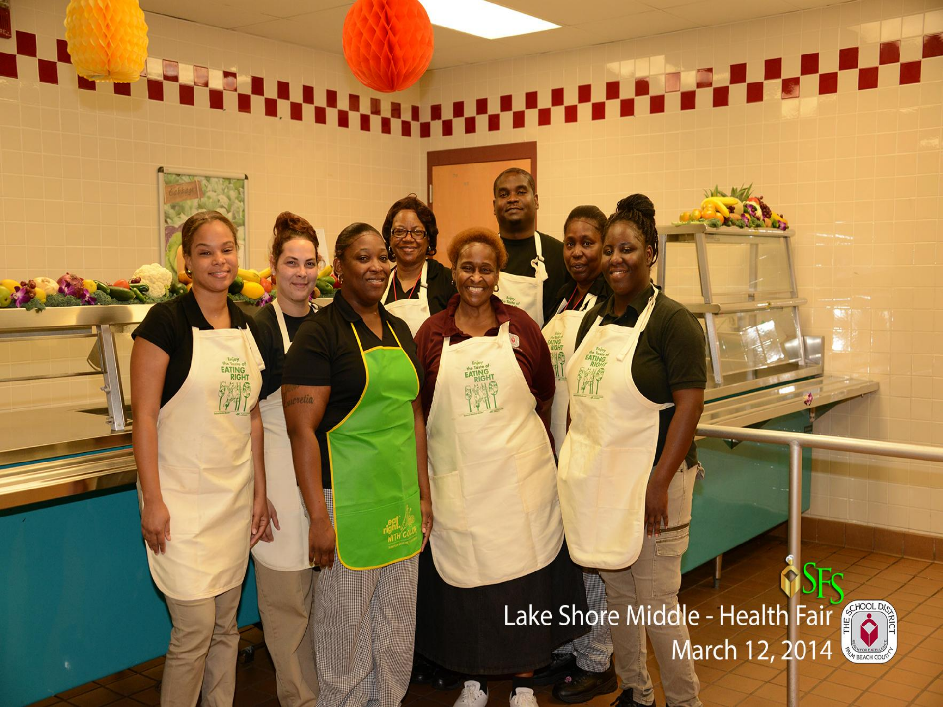
Lake Shore Middle - Health Fair March 12, 2014