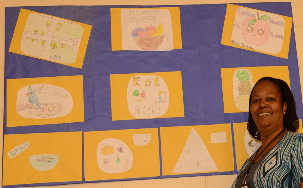
Lake Shore Middle - Health Fair March 12, 2014